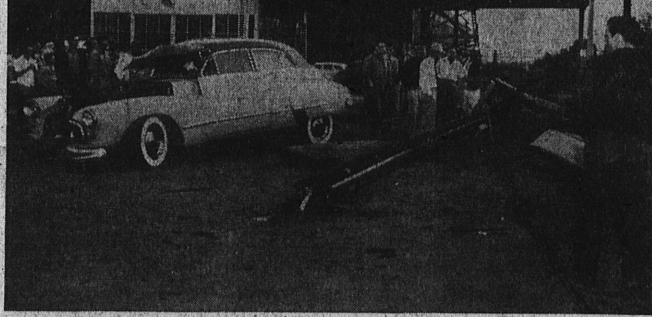
CRASH SCENE... After caroming through the intersection of 190th street and Western avenue, the auto at left carrying four persons snapped a power pole and came to rest in the yard of a filling station. All four occupants were injured.