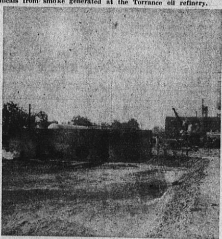
FIRE WALL... Motorists passing along Crenshaw boulevard have seen this wall many times almost hidden behind a huge curtain of flame. Two small pilot fires (left and right) ignite a mixture of gases and air shot through the holes from pipes and jets on the other side. The large fires, which can be seen for many miles at night, were turned out to allow photographer to approach the fire pit.