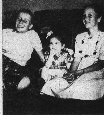
. . . Chews Her Nalls Right Up To . . .