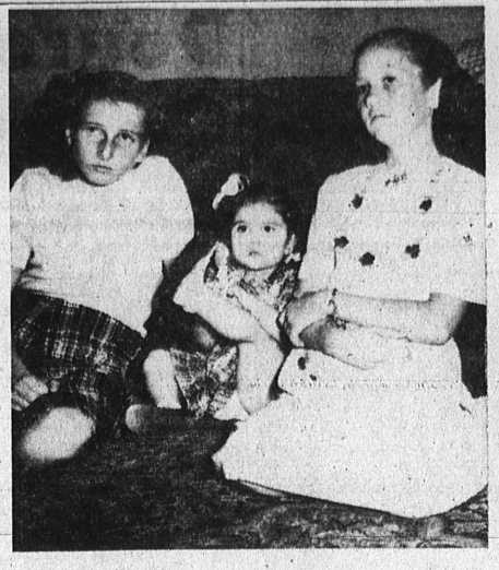
. . . Disinferest. And Finally . .