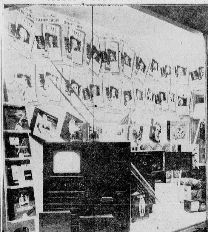
COMMUNITY CONCERTS WINDOW—One of the features arranged to draw attention to this year's Community Concert Series was this outstanding window of the National Home Appliance Company's shop on Sartori avenue. Prizes await the high school students who identified correctly all of the composers whose pictures were displayed

8624 S. Vermont Open 9 a.m. to 7 p.m. Dally—Friday and Saturday 'til 8 p.m. Sundays by Appointment