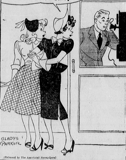
(Released by The Associated Newspapers)

LET'S STICK AROUND A MINUTE, HE MAY NOT GET HIS NUMBER!