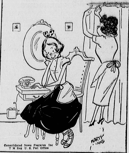
'Whata fast age we live in! Here I've been engaged to Neal since yesterday—and STILL! don't know his last name!''