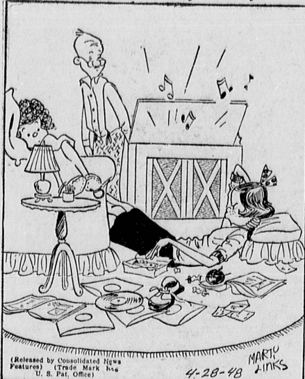
"Sure be glad when I'm of age, and can do what I want!"