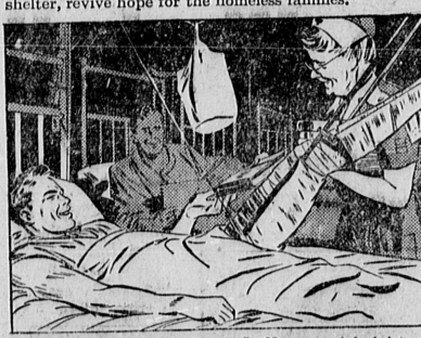
5 VETERANS MEEDED CARE. In Veterans Administra-volving claims, dependents, personal problems. Over 12,000 Red Cross hospital volunteers cheered veterans