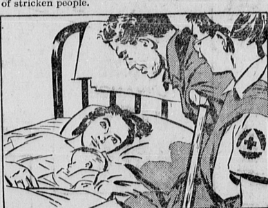
4 VETERANS HAD PROBLEMS. The birth of a baby, death in the family, help needed to pay bills: 2,029,007 cases for veterans and their dependents were handled by the Red Cross last year. For counsel, information, financial aid, the Red Cross advanced $6,441,983.