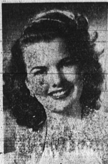
GALE STORM ... start to be featured at youth rally.