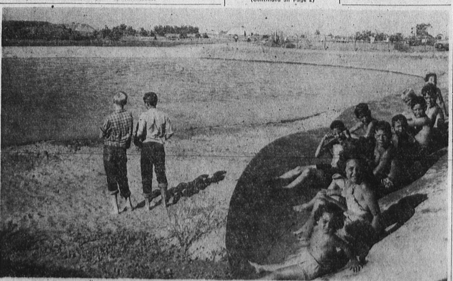
A POOL, BUT IT'S WET . . . Kids who live near Alonda k got a sneak preview of what the park's great outdoor pool belike when its completed later this year. After complete