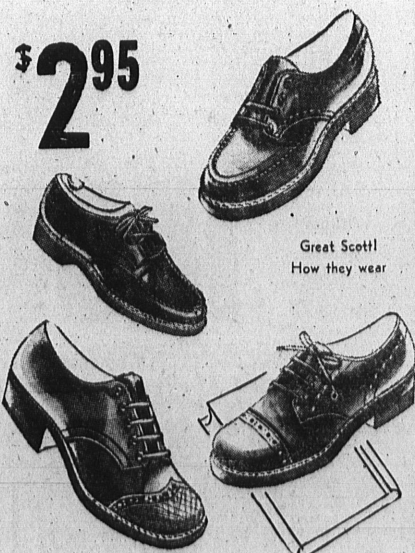
Great Scott! How they wear