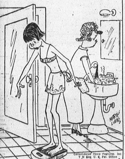
"Strange I haven't lost any weight—and I've cut out EVERYTHING except chocolate mints!"