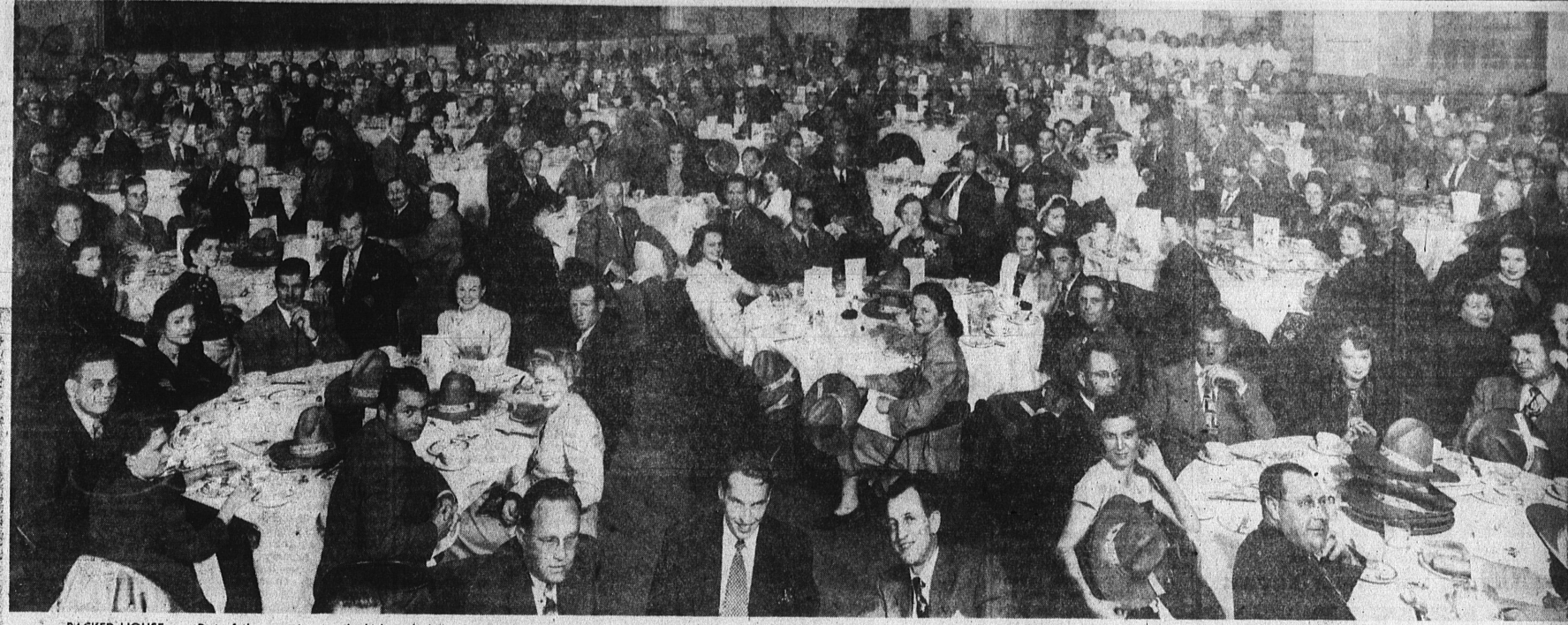
PACKED HOUSE . . . Part of the capacity crowd which packed the Civic Auditorium Monday night to attend the Annual Chamber of Commerce Round-up Banquet "Hold it" while cameraman snapped this photo to record the event.

PARKING ON HIGHWAYS It is well to keep in mind when traveling in strange states that most of them have laws prohibiting parking of vehicles on the road surface if it is possible to do otherwise. All insist upon no parking when visibility of the car in either direction is less than 200 feet.