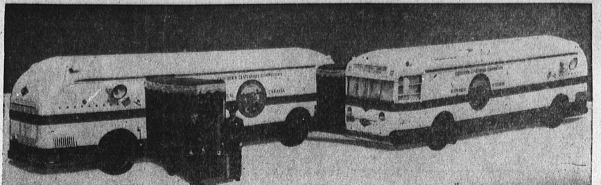
HISTORICAL CARAVAN—A collection of priceless historical objects and documents will begin a two-year, state-wide tour Feb. 4 in the California Centennials Commission's historical caravan. The two specially-constructed, all-steel buses will be seen soon in the course of the caravan's itinerary in Southern California.