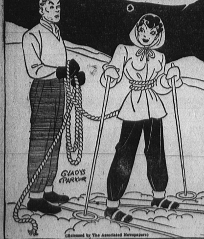
(Reprinted by The Associated Newspapers)

IT'S VERY SIMPLE. WHEN I REACH THE FOOT OF THE HILL, YOU JUST PULL ME UP AGAIN.