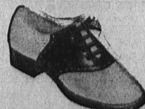
BROWN and WHITE

Size 8 1/2 to 12 $3.95 Size 12 1/2 to 2 $4.95