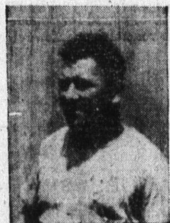
"SHORTY" CUSTOM BODIES