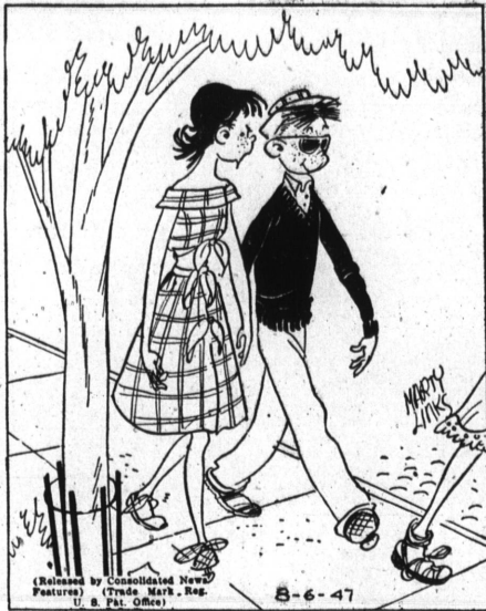
"Don't think I can't see you looking at other girls behind those glasses!"