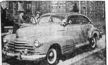
TWO OF MANY 1947 MODELS ON EXHIBIT . . . At left, 1947 Chevrolet Fleetmaster Cabriolet; and at right, 1947 Chevrolet Fleetline Aerosedan. These and several other attractive 1947 Chevrolet models will be on display Saturday.