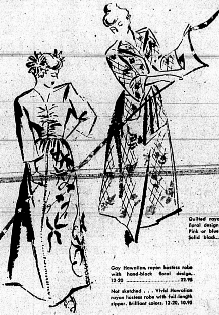
Quilted rayon opera with floral design, rayon blend. Pink or blue. 12-20, 19-95. Solid black. 22-95