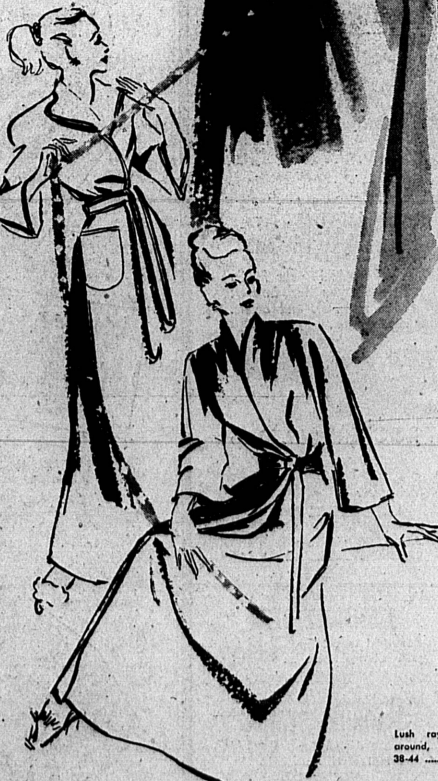
Below: Warm wraparound of rayon suede cloth with contrasting piping. Royal, copin, blue, berry, old rose. 12-20, 8-98

Quilted Robes, luxuriously full, warm, tailored wraparounds, bright, graceful hostess robes... a lovely answer to her Christmas wish from Benson's large collection.