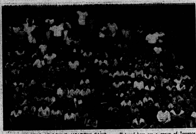
AT ROUND MEADOW CAMP . . . Pictured here are a group of Torrance recent encampments sponsored by the Torrance Y.M.C.A. at Round Meadov Calif. The "Y" is planning for its next year's program for the local youth, ac