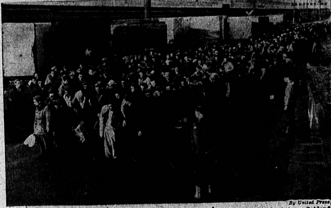
One thousand Italian war prisoners, interned at Warner, Utah, leave for their homeland from Oakland Port of Embarkation, Cal. They are the first contingent released from several detention centers in nation. The vessel will sail for New York City, via Panama Canal, pick up more prisoners, finally dock at Naples. More than 3000 are slated to sail this week.