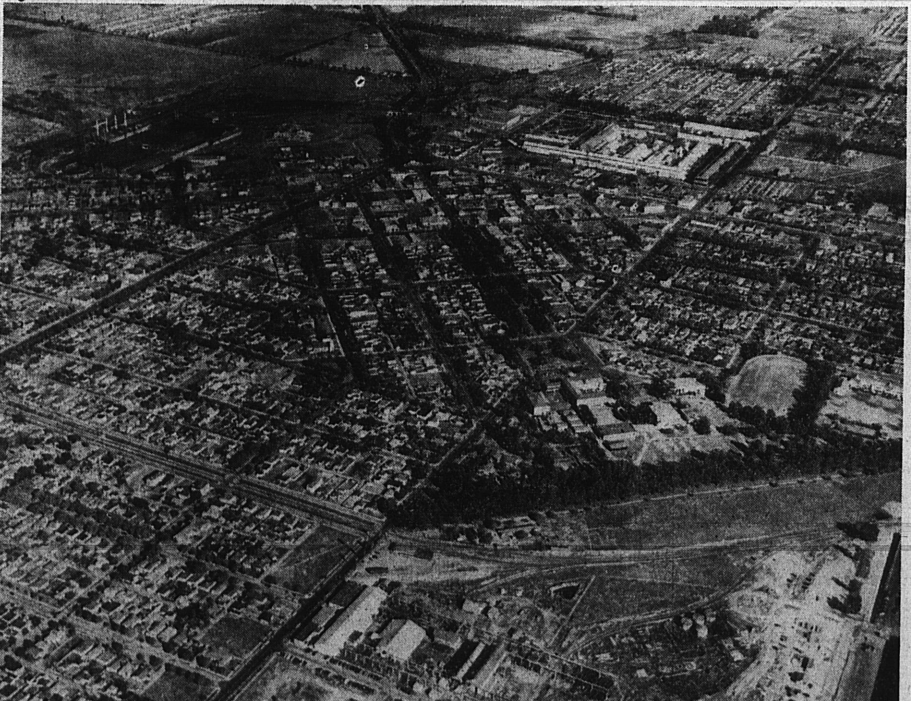
TORRANCE FROM THE AIR . . . Above is the first picture ever published of Torrance from the air, taken in a City of Torrance Chamber of Commerce sponsored mission last week from a U. S. Navy blimp from Squadron 31, Santa Ana Naval Air Station. The picture shows the central section of Torrance taken toward the northeast from a point approximately above Crenshaw blvd. and Jefferson st. In the lower part of the picture is International Derrick & Equipment Co., Torrance works.