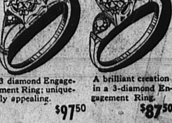
3 diamond Engagement Ring; uniquely appealing. $97.50