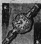
Lady's Watch; 17 Jewels; rolled gold plate; white back. $33.75