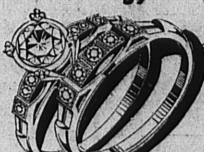
17-diamond Bridal Ensemble. A truly de luxe creation. Both . . . $150.00