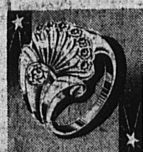
Lady's Cocktail Ring; dazzling in its brilliance. $21.50