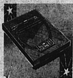
Man's Tie Clasp and Cuff-Chain Set. With initials. In gift box. $42.00