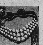
PEARL CHOKERS: A lovely piece of jewelry that she will adore. . . Priced at — $4.25