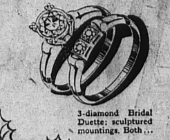
3-diamond Bridal Duette; sculptured mountings. Both . . . $99.75