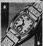
Water-proof, Shock-proof Watch for men; 17 Jewels. $37.50