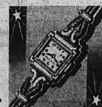
Lady's Watch; 13 Jewel movement — beautifully styled. $33.75