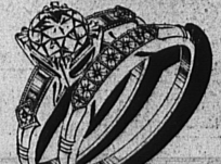
Diamond Bridal Duo in mountings of unique charm. Both . . . $59.50