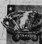
PORTOLIA GLASSWARE: Lovely gift ideas priced as low as — 65¢