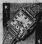
Man's Garland Watch; color of yellow gold. 7 Jewels. $27.50