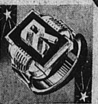
Man's handsome ring... with gold initial on onyx base. $27.12