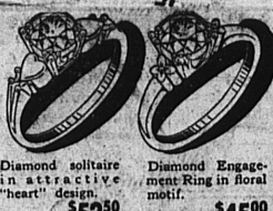
Diamond Solitaire in attractive "heart" design. $52.50