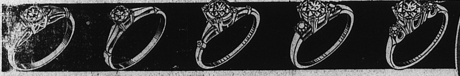
Diamond Solitaire Engagement Ring of rare charm. $57.50