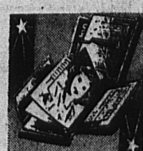
LADIES' BILLFOLDS: Smart selection for practical use. Only — $3.50