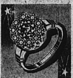
Lady's Cocktail Ring; enriched with fiery stones. $47.50