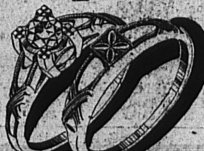
Diamond Bridal Set; beautifully carved mountings. Both . . . $44.50