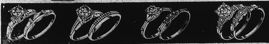
Beautiful sculptured diamond Bridal Duo, Both . . . $69.50