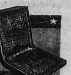
MEN'S BILLFOLDS: Wide selection of better billfolds. The kind he likes best. $4.80