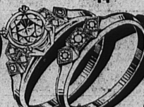
6-diamond Bridal Duette. Enchanting design. Both rings . . . $130.00