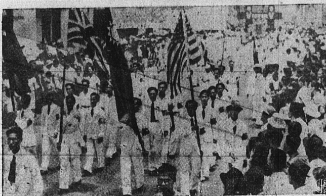
Chinese in Singapore celebrate the founding of the Chinese Republic for the first time in four years. Japanese who captured the city, and banned the Chinese celebration were driven out by the British and marched off to prison camps.