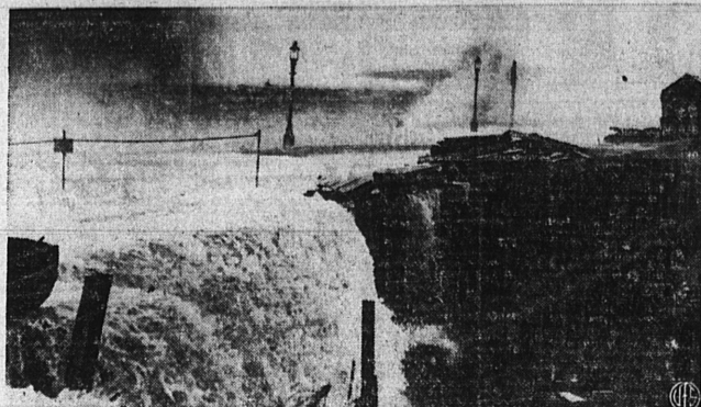
The British Isles recently were swept by wild autumn storms that upset shipping and caused vast property damage. GIs about to embark for the U. S. were held up until the storm subsided. Above is a piece of construction work at Seaford ripped to pieces by wind and wave.