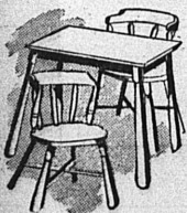
TABLE AND CHAIR SET $4.95 UP