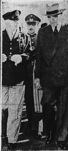
President Juan Antonio Rios of Chile arrived in San Francisco recently aboard the "City of San Francisco" on a tour of the United States at the invitation of the late President Roosevelt.

Printing with or without the union label. Torrance Herald, 1336 El Prado.