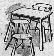
TABLE AND CHAIR SET $4.95 UP