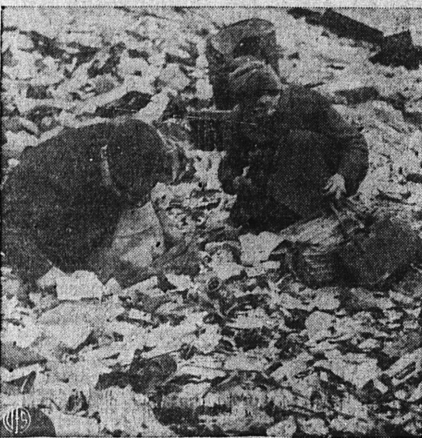
Hungry Germans pay the price for defeated military aspirations as they pick through refuse dump in Berlin for scraps of food. GI trucks use this area to discard kitchen waste and Berliners come a long way to forage for food in the dump.