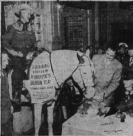
Silver King, brother of Emperor Hirohito's famed white horse, celebrated Navy Day in San Francisco by lunching at the swank Whitcomb Hotel dining room.