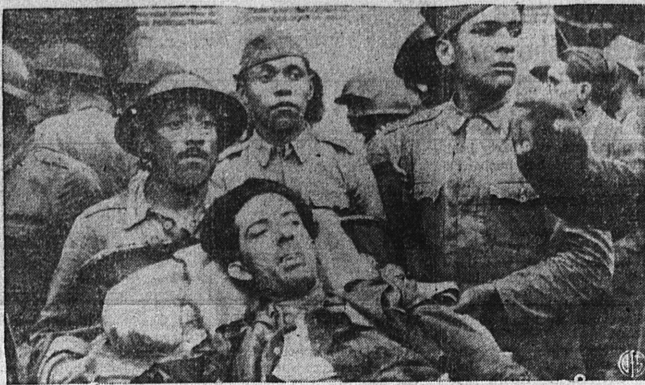
This Venezuelan soldier was wounded while fighting on the side of the revolutionaries in the recent political flare-up in Caracas. His buddies are carrying him to a hospital. Romulo Betancourt, head of the revolution, said the revolution had succeeded throughout the country.