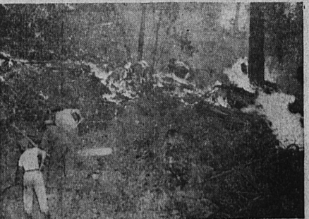
Soldiers from nearby Army posts fight a stubborn timber and brush fire that started in Lagunitas Canyon, just north of San Francisco, and threatened the resort town of Sausalito. Fanned by a 60-mile wind, the fire swept over the western slopes of Mt. Tamalpais to within one mile of Sausalito Beach.