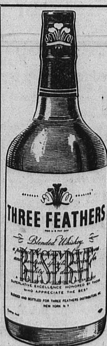
Three Feathers RESERVE BLENDED WHISKEY 5th $395 Pt. $247

HIRAM WALKER'S LONDON DRY DISTILLED GIN 5th $302