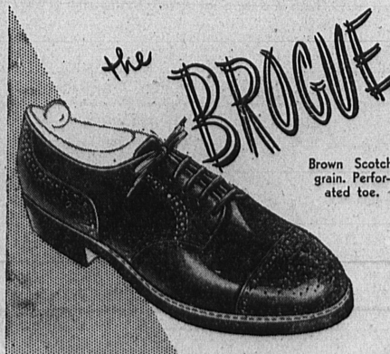
Brown Scotch grain. Perforated toe.

GLAMOROUS fall shoes to take you flatteringly and comfortably on your way. Kids, reptiles and suedes in the styles you adore. They're barely any shoe—but how they enhance your leg! Our stock is now complete. Come in and make your selection.