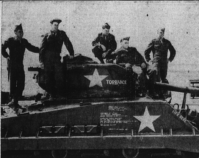
TORRANCE TANK AT SHOW ... Scheduled for honors in Hollywood Bowl on Saturday night, California's own "Black Cat" Division of the Armored 13th will receive a special citation of merit from the hands of Governor Earl Warren when Victory Chest volunteers gather to share the salute from the radio industry. Shown here is Torrance's own replacement tank, which represents the one named for this city in a ceremony held at Camp Beale July 4.