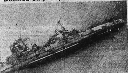
The Japanese cruiser Oyodo capsizes in a cove near the Nipponese Naval Base at Kure, Honshu, where she sought safety from a swarm of American and British carrier-based planes of Admiral Chester W. Nimitz' Third Fleet in frantic poundings of Japanese home islands.