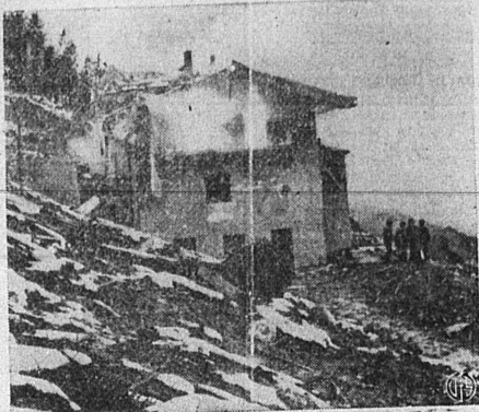
Hitler's house, as well as Hitler's fortress Europe, both alleged impregnable, came to a desolate finish. Berchtesgaden, Austria, was racked with bombing by Allied airmen and was soon reduced to rubble. SS guards set fire to it just before the Yanks moved in. Here it is still burning. Pictures of scene lie on the main inside.