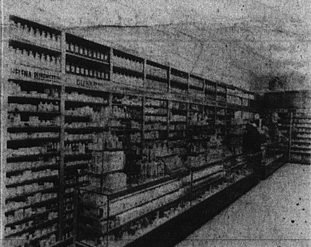
MID-CITY DRUG STORES OPEN HERE... With their opening today marking four days of special bargains, Mid-City Drug Stores opened their new $100,000 institution in Torrance today. Shown above are several scenes in the modern self-service store, and the front itself at 1315 Sartori ave. Island counters make