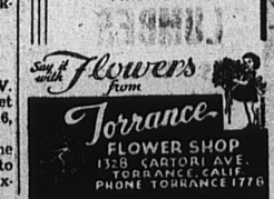
Flowers from Torrance FLOWER SHOP 1128 CARTORI AVE. TORRANCE, CALIF. PHONE TORRANCE 1776

AND NOW — a Western-Holly GAS RANGE You'll Be Proud to Own!