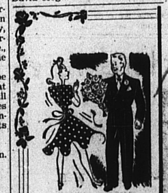
WANT TO BE A HERO TO YOUR FIRST GIRL?