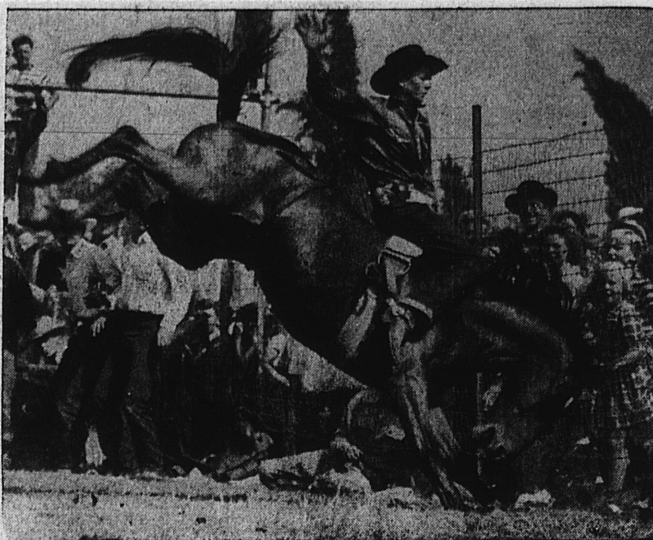
FOURTH OF JULY THRILLS . . . Scenes such as the above will thrill thousands of Torrance and nearby community rodeo fans on July 4 when the Third Annual Torrance Rodeo is held in Torrance ball park. Two thousand extra seats are being provided to help care for the crowds who will pack the park. The finest Cowboy Association of America rodeo artists and stock will be brought here for the big show. Tickets now are on sale, both for the rodeo and the cowboy dance July 4 evening, in Civic Auditorium.

TELEVISION The Board of Supervisors authorized an application to be sent to the Federal Communications Commission for a television permit for the purpose of servicing the County departments, notably the Sheriff's office and the Courts.