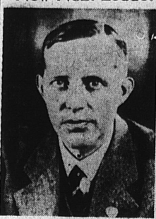
By United Press British-educated Count Ludwig Schwerin von Krosigk, nephew of the late Kaiser Wilhelm, was made German foreign minister, succeeding ousted Joachim von Ribbentrop, in the first official act of Second Admiral Karl Doenitz.