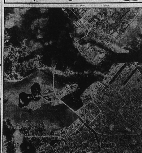
Pin-point bombing by Navy bombardiers sends a tremendous column of smoke skyward from Naha City dock area in Okinawa. Your purchase of more and more War Bonds can also speak with telling effect in the Mighty Seventh War Loan.