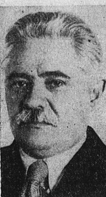
D. Manulski is the chairman of the Ukrainian Socialist Soviet Republic delegation to the World Security Conference in San Francisco.