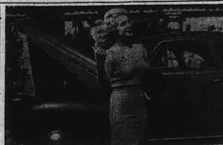
WHEN CAR GOES "OFF THE JOB" . . . Here's a situation that may face war workers and motorists generally when they neglect car upkeep. Photo is of Chili Williams, RKO starlet.