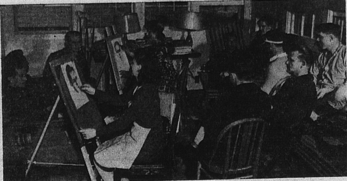
ARTISTS DRAW PORTRAITS AT ARMY HOSPITAL... Torrance's Army hospital's special service office has arranged a project whereby groups of the most talented artists in Southern California pay weekly visits to the hospital for the purpose of sketching lifelike charcoal and pencil portraits of hospital patients. Above in action with a group of the patients are shown two of the artists.