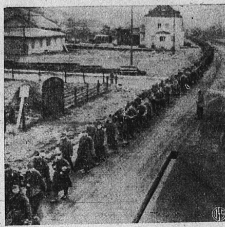
En route to prison camps, unending lines of German captives pass through captured Remagen, guarded by U. S. doughboys.