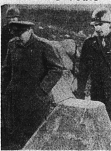
Britain's Prime Minister Winston S. Churchill is accompanied by U. S. Lt. Gen. William Simpson on recent tour of the Siegfried Line.