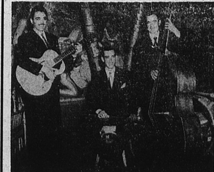
THE THREE NOTES

Nothing like it on the Pacific Slope! You must see it to believe it! Our Cooking . . . our splendid Tropical Gardens. Make your New Year's wish come true in our Romantic Wishing Well!