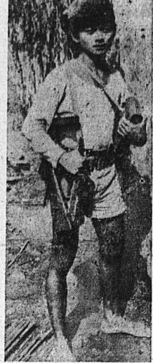
This youthful Filipino fought two years with guerrilla bands during the Jap occupation of his homeland and was attached to American units after MacArthur's return. He wears captured Jap fur hat, an American tommy gun, pistol belt and map case—but no shoes.

Motor vehicle owners of Los Angeles county may save precious gas and tires by mailing applications for 1945 registration renewal to the local office of the Department of Motor Vehicles.