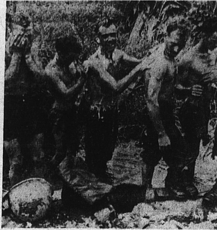
U. S. Seventh Division infantrymen wash themselves, clothes, shoes and equipment in a muddy stream during a lull in the fighting around Naruan, Leyte Island.

"A building job is a building job," local War Production Board officials pointed out today—adding the moral that there's no use trying to split it up into smaller jobs so as to get around the $200 limit on priority-free residential construction.