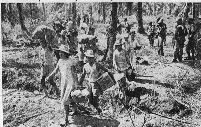
Filipinos streaming through American lines on Leyte Island to escape mortar and gun fire as Yanks clashed with Jap forces. Each native carries some of his belongings. Temporary safety was found on invasion beaches.