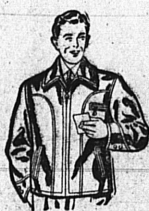
CAPE SKIN JACKET