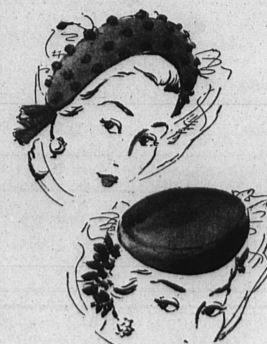
Do People Look Your Way? THE HEADS HAVE IT 2.98

HATS—soft felts, softly fitting your head, in softest colors. Sometimes a snatch of veil, sometimes a garland of felt flowers. The new Casablanca brim for an exotic touch!