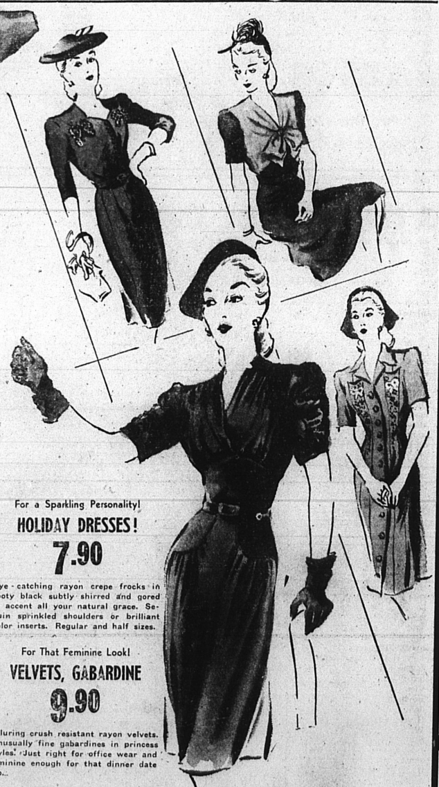
For a Sparkling Personality! HOLIDAY DRESSES! 7.90

Smooth fitting, full-fashioned hosiery that will give you beauty—full, duty—full service. Clear, wear-well rayons. Reinforced adequately.