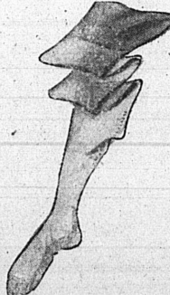
"DURATION SHEERS" Round-the-Clock Duty! 80c

Penney's newest selection of leather gloves will give you long service and look right with every day-time costume.