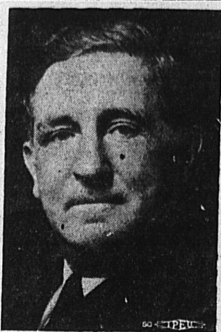
SENATOR DOWNEY... who will speak at Democratic rally in Redondo Beach tomorrow night on "Post-War Jobs."

Doves and quails are migrating from Lassen, East Plumas and Sierra counties on account of the cool nights.